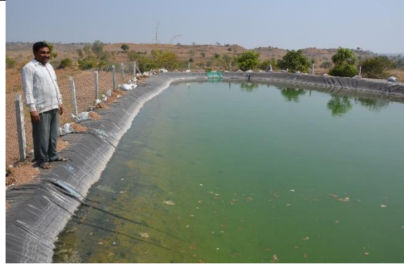
Check Dams / A check dam constructed for soil and water conservation in Shiswad, Akole block, Maharashtra