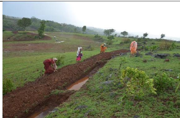
Farm Ponds / A farm pond for storing surface run off water in Sarole Pathar, Sangamner block, Ahmednagar, Maharashtra