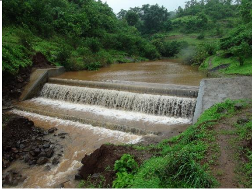
Water Budgeting / Display of available groundwater on a water budgeting board in Sunderwadi, Paithan block, Aurangabad, Maharashtra