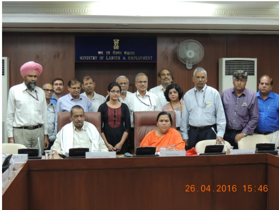
National Water Mission Website Development Team with Sushri Uma Bharti, Hon'ble Minister (WR, RD & GR) and Prof. Sanwar Lal Jat, Hon'ble Minister of State for WR, RD & GR on 26.04.2016

The contents have been grouped systematically under drop down menu bars, allowing for easy navigation. Policy intervention, State Specific Action Plan(SSAP), Demonstration project, vulnerable and over-exploited areas, Integrated water resources management, Study and Research, new initiatives MoWR organizations, other Ministries, State Water Resources Departments and Collaborations.