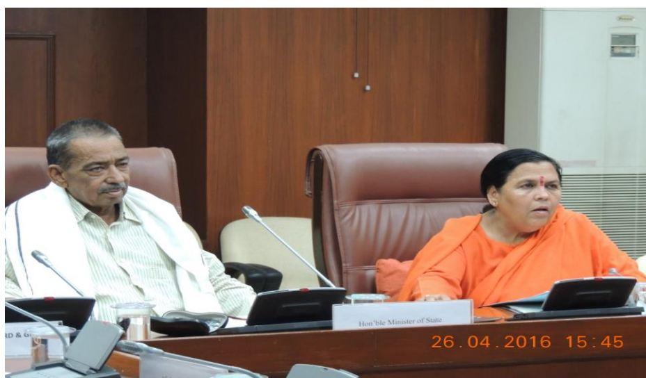
National Water Mission Website Inaugurated by Sushri Uma Bharti, Hon'ble Minister (WR, RD & GR) in the presence of Prof. Sanwar Lal Jat, Hon'ble Minister of State for WR, RD & GR on 26.04.2016 at Shram Shakti Bhawan, New Delhi